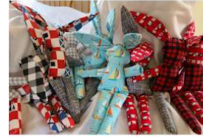
The Pike Stories